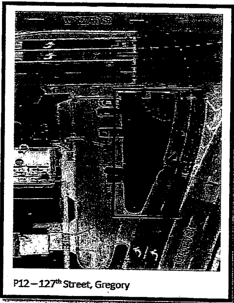
P12 – 127 th Street, Gregory

The Community Development Committee chose these three (3) landscaped sites because they illustrate three (3) vital places that make Blue Island very special and memorable.