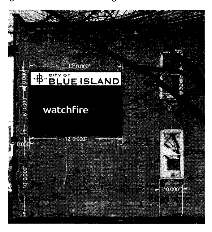
PLEASE NOTE: This sign will require 120V 44.0 amp single phase service.

Supply (1) single sided wall mounted LED illuminated ID cabinet with lexan face decorated and a single sided 10mm full color Watchfire Electronic Message center with 6' \times 12' viewing area.