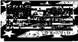
EXHIBIT E - PROJECT SUMMARY

2020 Program Year: October 1, 2020 through September 30, 2021