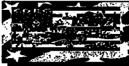
EXHIBIT E - PROJECT SUMMARY

2020 Program Year: October 1, 2020 through September 30, 2021